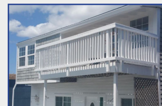
6 East Pier sold $750k Large floating home, 3 view decks and floating dock