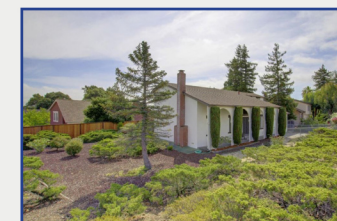
35 Blanca, Novato sold $825k Great starter large lot