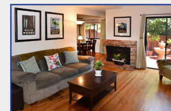
30 Cedarwood, Novato sold $610k Warm & charming townhome w/large yard