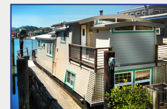
39 Liberty Dock sold $849k Deep water berth Mt. Tamalpais views