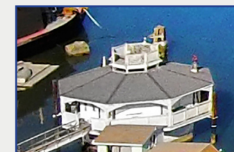
52 Varda Landing sold $1,200k Secluded, hexagon design floating home (closed 4/18/18)