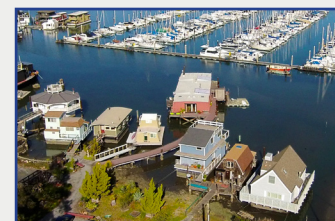
60 Varda Landing sold $1,600k Magnificent waterfront property, needed TLC