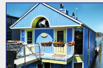
67 Issaquah Dock sold $1,700k Stunning floating home with water views